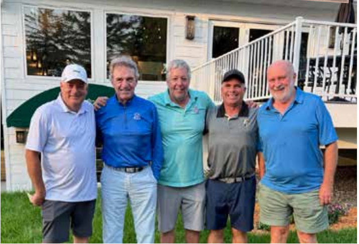
NLMF winners: The Crusaders & The Sword of Justice Team