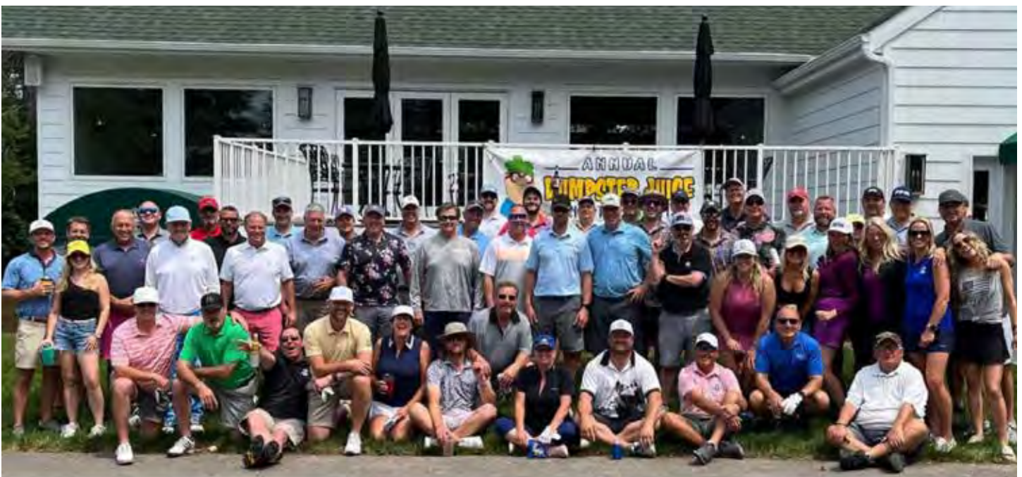
10th Annual ECC Spring dumpster Juice Golf Tourney – another great day with a fun bunch!