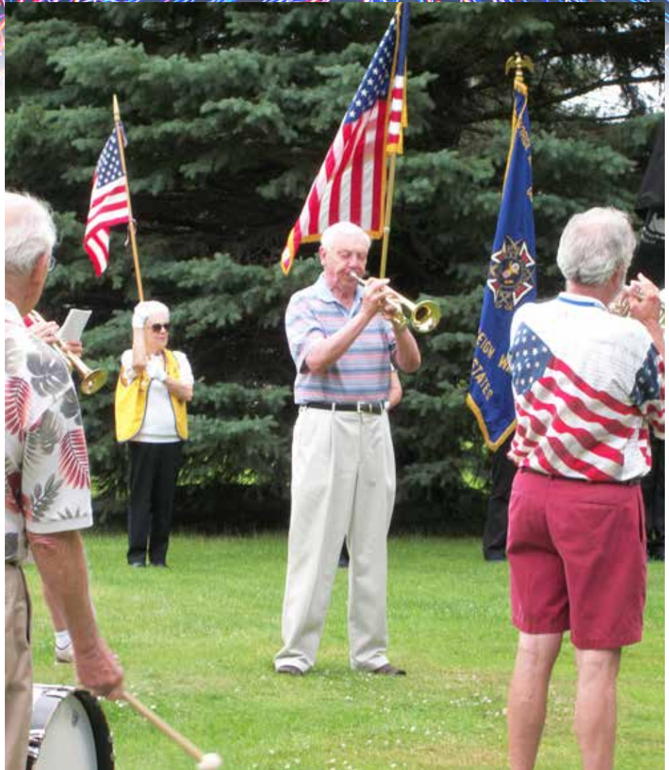
Flag ceremony in 2010

This is a new event! After all of the above you'll be for-sure relaxing in your beach chair or maybe you'll want to be at the helm of your craft for this new ECC extravaganza. There will be prizes