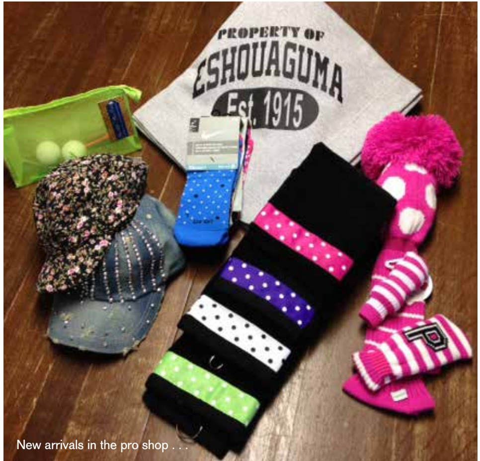
New arrivals in the pro shop . . .