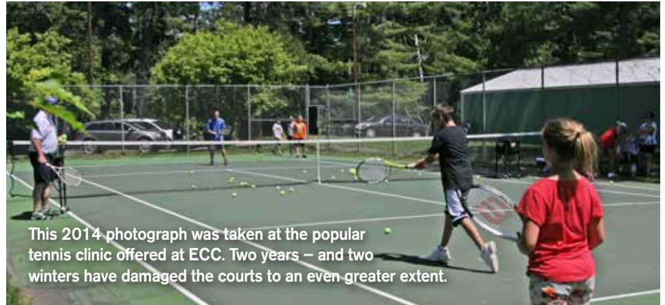
This 2014 photograph was taken at the popular tennis clinic offered at ECC. Two years – and two winters have damaged the courts to an even greater extent.