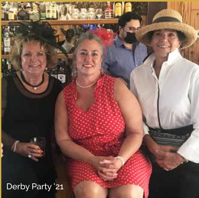
Derby Party '21