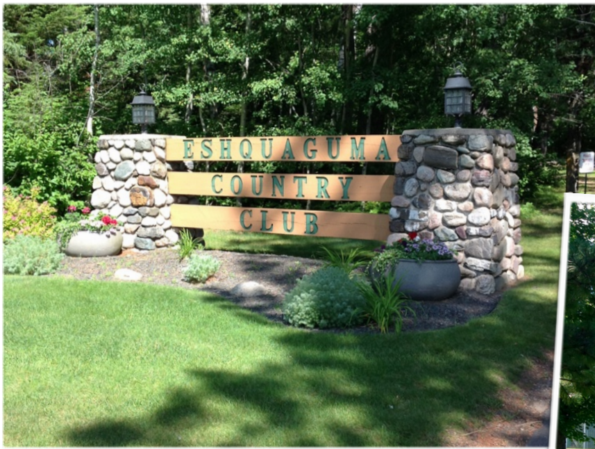
Hole 1 - Velkommen